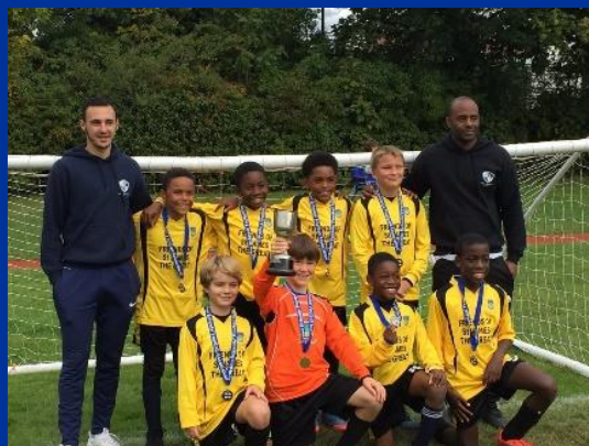
Winners are grinners... Well done boys, not just for winning, but how you won and your sportsmanship. We are very proud of you.