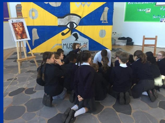
Y5 having Hobgoblin Theatre workshop exploring their history topic of Ancient Egypt