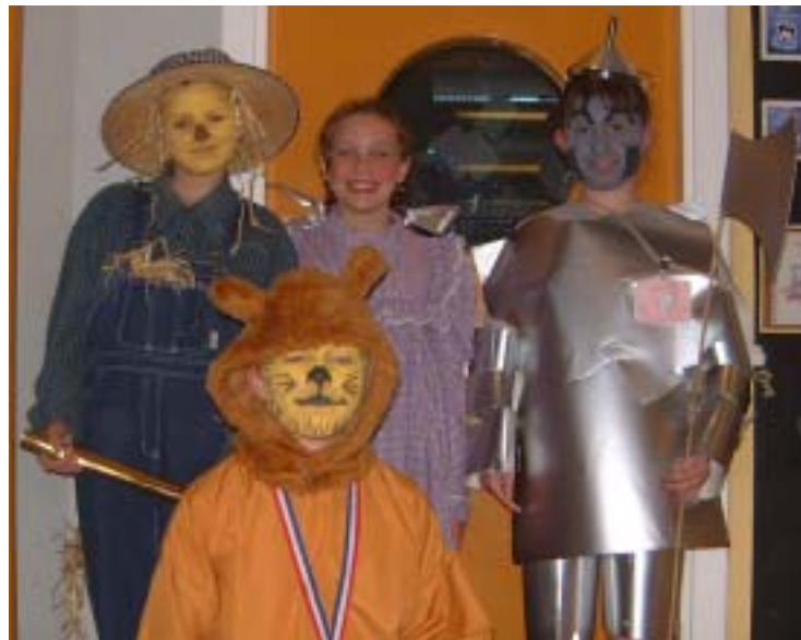
Wizard Of Oz Production 2001