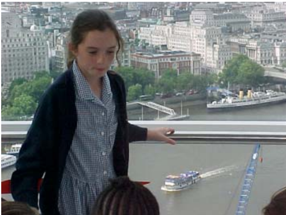
Year Six at The London Eye

The School will foster a respect for self and others in a climate of tolerance of individual differences, whilst recognising the importance of striving for excellence and enhancing children's transition to responsible adulthood.