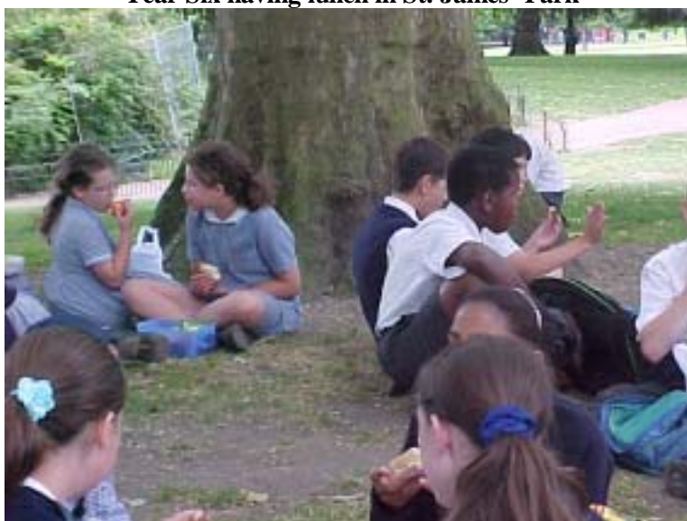
Year Six having lunch in St. James' Park

Key: D- Disapplied; W - Working towards; Abs. – Absent; U – unable to assess due to absence or disapplication; X – not required to be entered for reading comprehension test or spelling test, or not awarded a level from reading task because Level 3 achieved in reading comprehension test; L – statutorily entered, but did not obtain at least Level 2; 0 represents some pupils, but less than 0.5%. B represents pupils who were assessed by teacher assessment only. N represents pupils who failed to register a level for reasons other than absence.